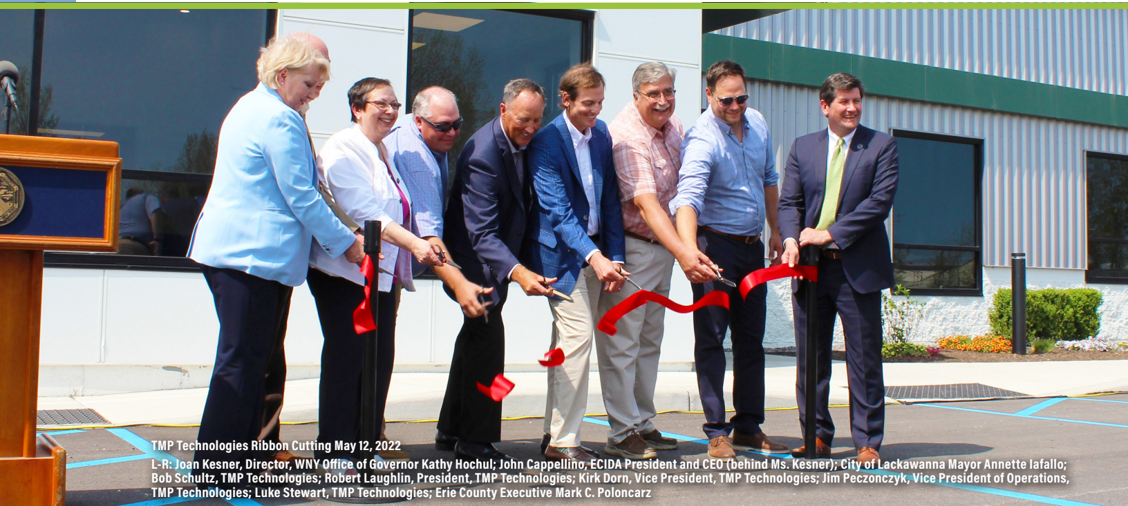
TMP Technologies Ribbon Cutting May 12, 2022